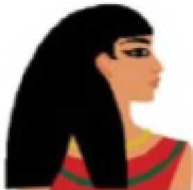
Wife of Potiphar